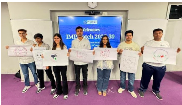
Fostering a Safe and Inclusive Campus: Anti-Ragging Week observed at Prestige University