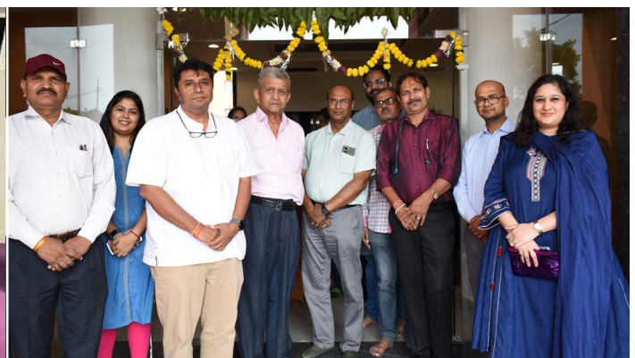
Where Memories Take Root: PU's first batch alumna inaugurates the new hostel